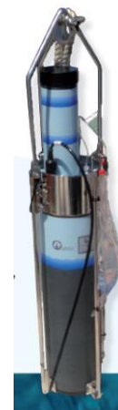
Figure 2 In-situ field probe for long term measurements

The water quality monitoring system is equipped with a communication module for real-time wireless data transfer to a remote control center, where data processing takes place, enabling alarm functionality of early warning system. Two field experiments are going to be performed in La Spezia (Italy) using a floating platform and in Piran (Slovenia) using a large coastal buoy.