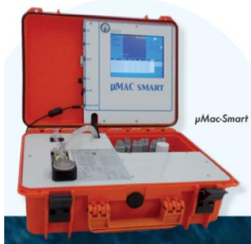
Figure 1 Portable analyzer automating complex analytical methods

In particular, a modular measurement prototype based on Enzyme Linked Immuno- Magnetic Optical (ELIMO) assays, is operative to detect microalgae from genera Alexandrium , Dinophysis and Pseudo-nitzschia . The water sample is automatically pretreated by a separated automated module performing water sampling, cells preconcentration and lysis.